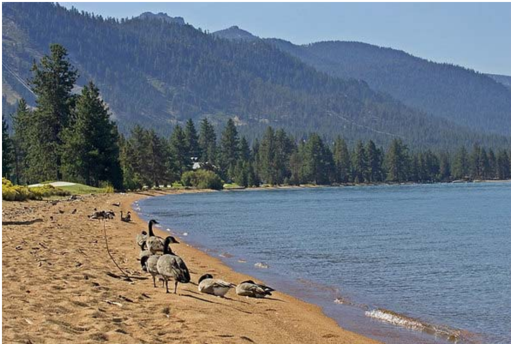
View from the beach, Nevada 4-H Camp, South Lake Tahoe.